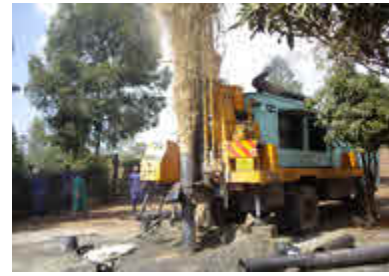
Because of this