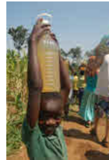
No more of this