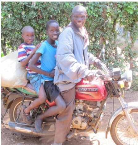
Piki Piki taxi taking food to feed families during the school holiday.

Many of you will have read the recent news about famine in Nigeria, Sudan, Ethiopia and Somalia. The situation in those countries is so severe that the UN is calling it the worst humanitarian crisis it has seen since it first began in the 1940s. It is easy to blame the usual culprits for it - war, bad governance, poor planning and climate change. They are all