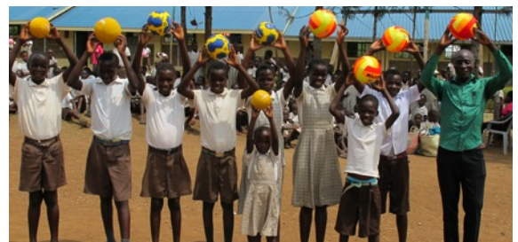
Some of the sports equipment bought with the money raised by Hazel Oak School